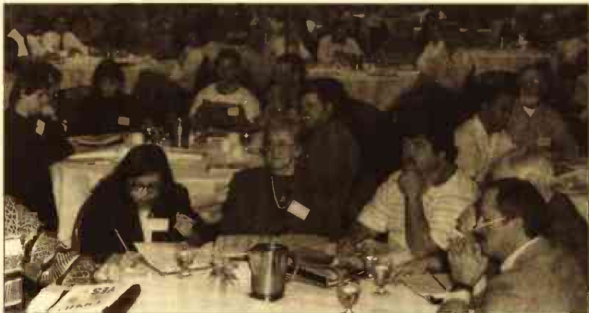
Nearly 200 OPEIU delegates attended the Western Canadian Regional Education Conference.