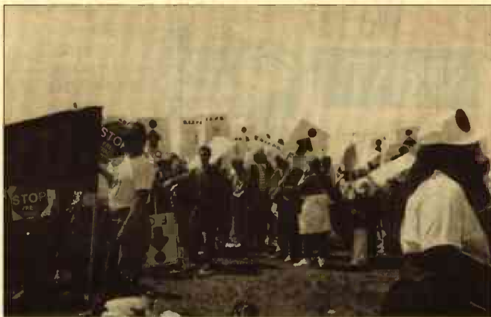
Quebec and Ontario members prepare to march on Parliament Hill.