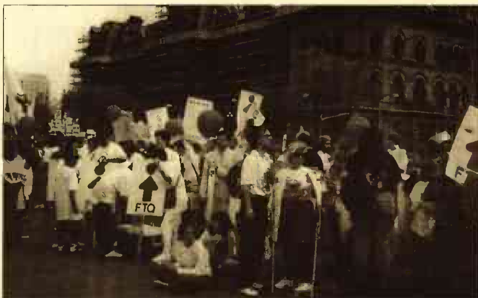
Quebec locals line up.