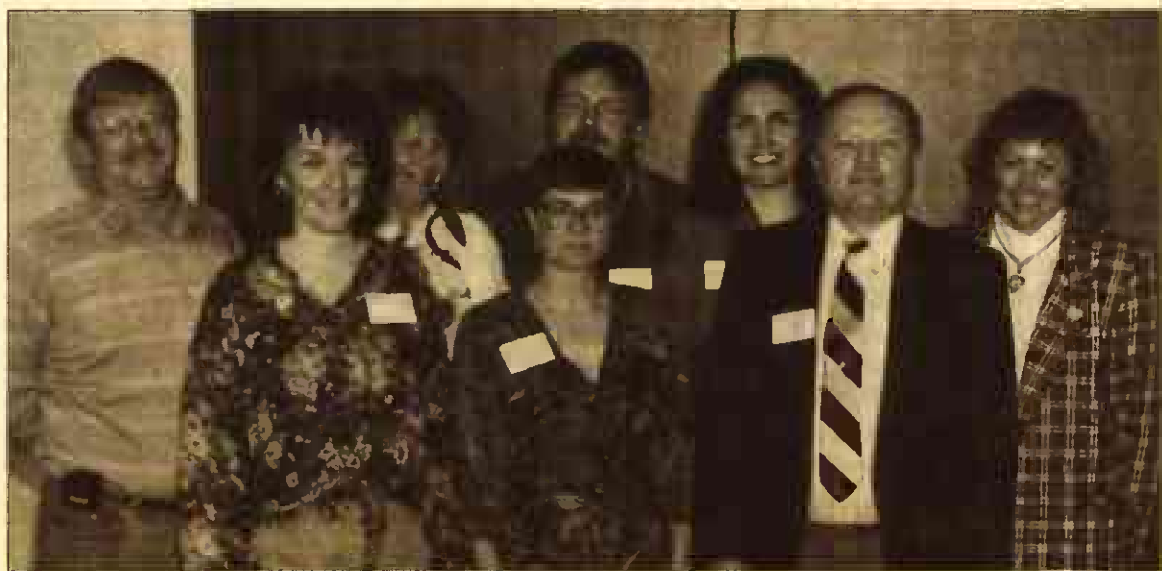
Local 378's education committee, which organized the conference, pose for this photo opportunity.